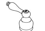
Hot Handle: KBH601ALH